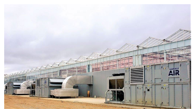
Sealed Greenhouse with Advanced HVACD Equipment

In contrast, sealing your greenhouse would mitigate, or eliminate, every risk noted above for an open greenhouse. Because advanced HVACD systems are used to control the climate in a sealed greenhouse, you can virtually eliminate the wide temperature and relative humidity swings. If designed properly – and that can be a big "if," we'll explain later – you can nearly maintain as tight control over your climate in a sealed greenhouse as you can in an indoor grow facility.