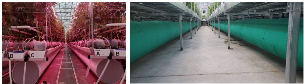
Examples of The Three Principles of Air Distribution Design

dehumidifying the greenhouse. Not only will this cause you to lose control of the greenhouse climate, but this will shorten the life span of the components in your unit, mainly the compressors, and will eventually lead to an unexpected failure of your equipment.